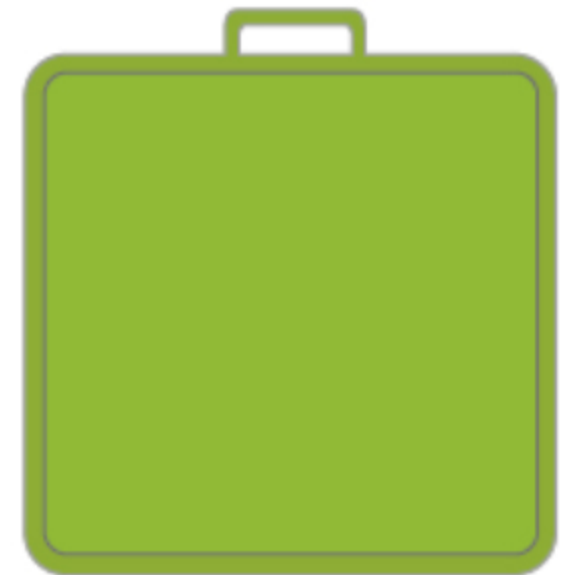
SEAT CUSHION WITH OR WITHOUT SEAT BACK NOT TO EXCEED 18" X 18"